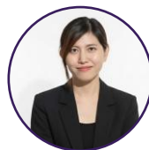
Lac Boi Tho